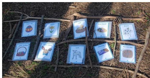
Cygnets class enjoyed their Easter Tens Frame treasure hunt.