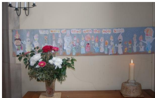
Melissa class made a banner for Pentecost, which was displayed in the churches in Shotley, St Mary, and Chelmondiston, St Andrew.