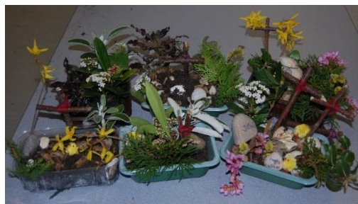
Easter Gardens made by our after school 'Late Bird Club'

Here are some other learning highlights from this year: