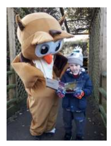
Reading at the owl sanctuary

Everyone has entered into the spirit of the competition and we await the judge's decision with baited breath.