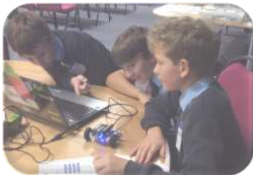
Year 6 demonstrated fantastic problem solving and team work when they visited Adastral Park in order to learn how to program a Crumblebot.