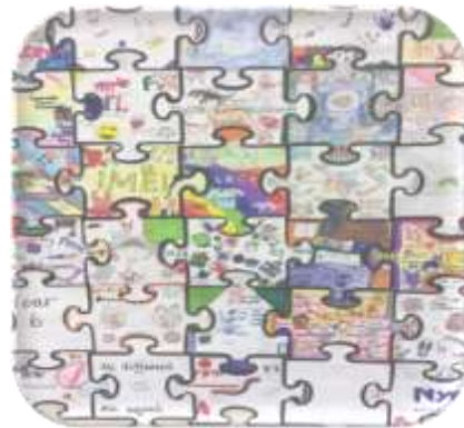
We joined in Anti Bullying Week: All different - All equal