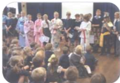
Japanese Club shared their learning about Japanese culture and language during our whole school Languages Week.