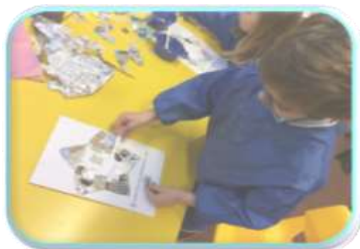
Year 2 have been exploring collage techniques and finding out about artists that create collages.