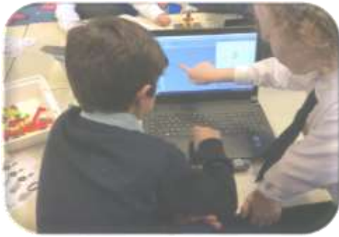
Children in Year 3 and Year 4 have been writing code to programme their Lego WeDo models