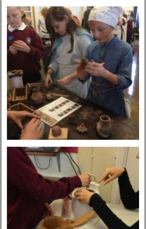
They even made their own wax candles.

The children in upper key stage 2 enjoyed a viking day experinece completel with warrior training and a camp fire.