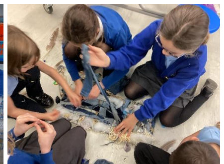
Pupils at Chelmondiston love being scientists and carrying out experiments.