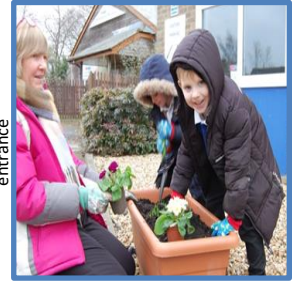
Planting out pots for the school entrance