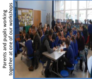
Parents and pupils working together at one of our workshops