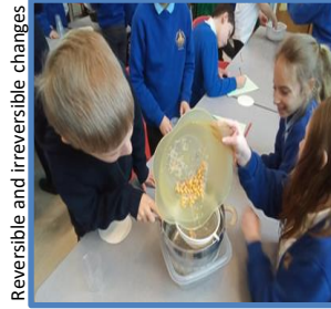
Reversible and irreversible changes

Here are some more of our spring term learning highlights: