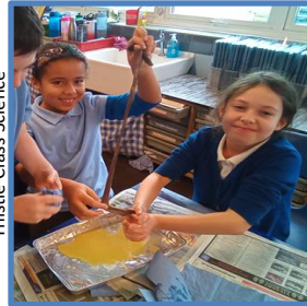
Thistle Class Science