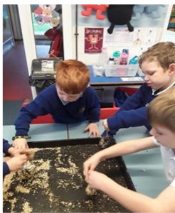
Children in Cygnet Class made bird feeders from pinecones and seeds.

As part of our SMSC (Spiritual, Moral, Social and Cultural) learning, we had a special day for the whole school where children considered what Morality means. Children were encouraged to consider what is right and wrong. For example, children were asked to decide if some living creatures are more important than others. Children also thought about dilemmas and difficult choices, relating the stories from the bible and traditional tales.