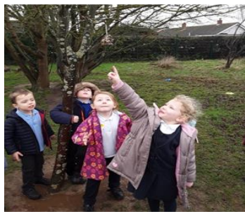
The children have enjoyed watching the feeders being used by the birds.