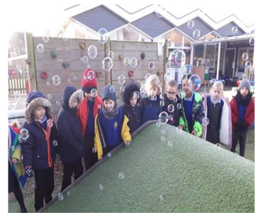
Bubble Science in KS1