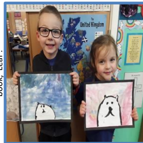
Polar bear Art, inspired by the book, 'Leaf'.