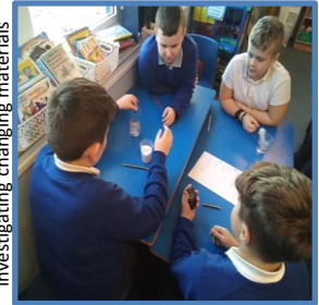
Investigating changing materials