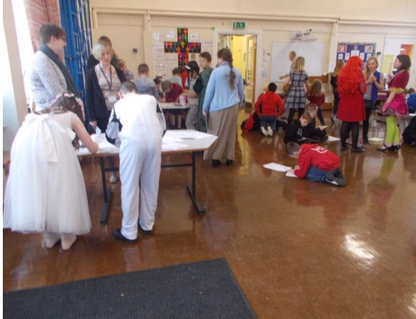
Maths Cafes held earlier this term. Upper Key stage 2.